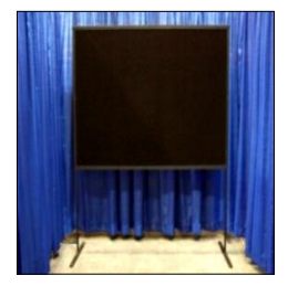
4'x6' or 4'x8' Tackboard Single or Double Sided