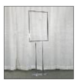
Chrome Sign Stand