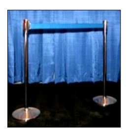
Chrome Stanchion w/Retractable Belt